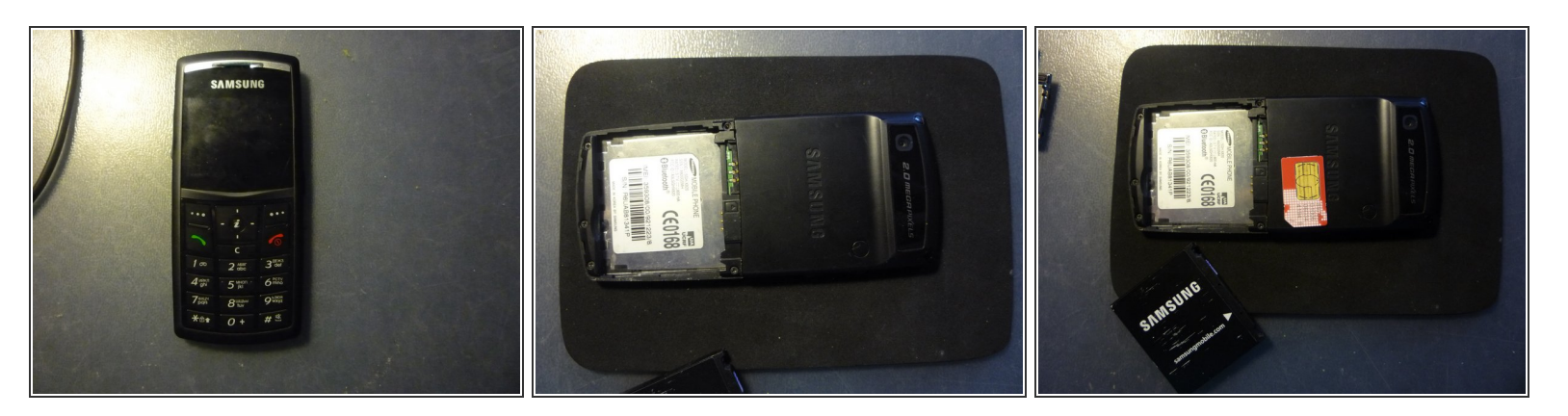
samsung sgh x820